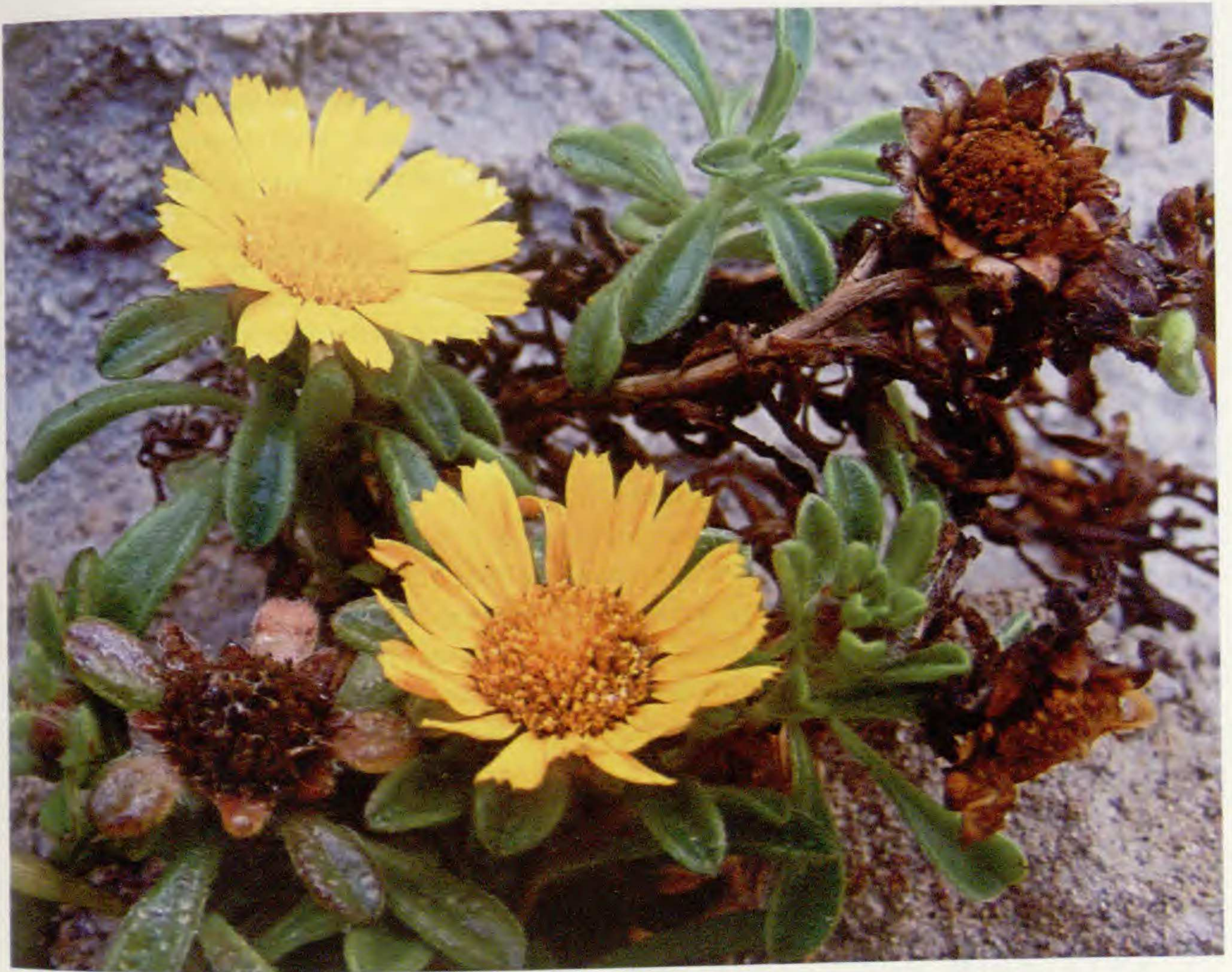
FIG. 1. Photograph of Pallenis maritima growing at Moss Cove, Laguna Beach, California. The flower heads shown in the photograph are approximately 3.6–3.8 cm wide. The small white patches visible on the leaves and bracts in the lower left-hand corner are salt crystals formed from ocean sprays.

Pallenis maritima is a cushion-forming subshrub (a low, spreading woody perennial) that grows up to 40 cm tall and about 1 m wide. It is known from the Western Mediterranean region, extending to S. Portugal along the Atlantic Coast, with casual occurrences in Great Britain and N. France (Wiklund 1985). Pallenis maritima grows on sand dunes, cliffs, and rocky shores primarily along the coastline, and it frequently occurs within the salt-spray zone (Beckett 1993; Mucina 1997; NATURA 2003; Estrada et al. 2011). It is also found in dry grasslands of North Africa and Spain, and grows on limestone, clayey soils, including marl, and sandstone (Wiklund 1985).